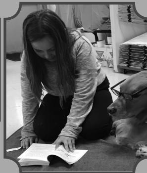
Brody our new Pet Partner